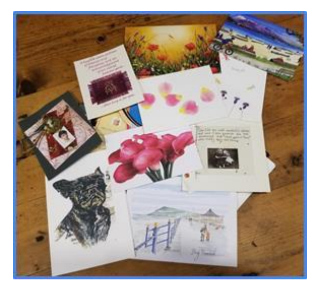
Figure 2 Selection of Pictures and Postcards

Students were asked to first self-reflect and then share the meaning of clinical education, the educator's role, and how this was represented in their chosen image. Some students used the picture as a metaphor, such as a basket symbolizing a toolbox of strategies they would gather. Others created stories and guided the class through a day as an educator or expressed the educator-student relationship. This strategy's effectiveness derives from the educator's ability to use art and pictures as a form of guided imagery to facilitate connections through metaphors, symbolism, and stories (Blomqvist et al., 2007; Nguyen et al., 2016; Segal-Engelchin et al., 2020). Such approaches can evoke students' emotional responses, prompting expressive dialogue, self-development, and thoughtful reflective practice (Brand & McMurray, 2009; Lutter et al., 2018). By communicating their reflections, students essentially co-produced knowledge, which can help educators understand the group's subjective and social experiences, further guiding their teaching strategies (Segal-Engelchin et al., 2020).